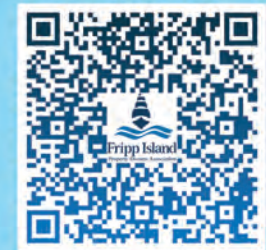
Scan QR Code for Digital Map